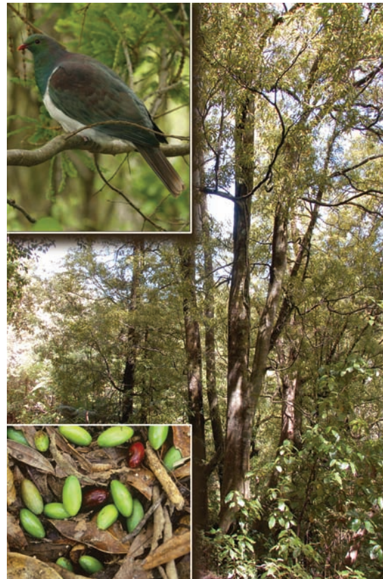
Fig. 1. Forest canopy trees such as Beilschmiedia tawa are dependent on kereru ( H. novaeseelandiae ) for dispersal of their large (>1.4 cm in diameter) fruits, because other potential dispersers are extinct or very rare.

Here I explore how species invasions can impose biotic thresholds limiting the success of ecological restoration projects. I use New Zealand as a case study because the impacts of biological invasions are particularly pronounced as a result of the archipelago's